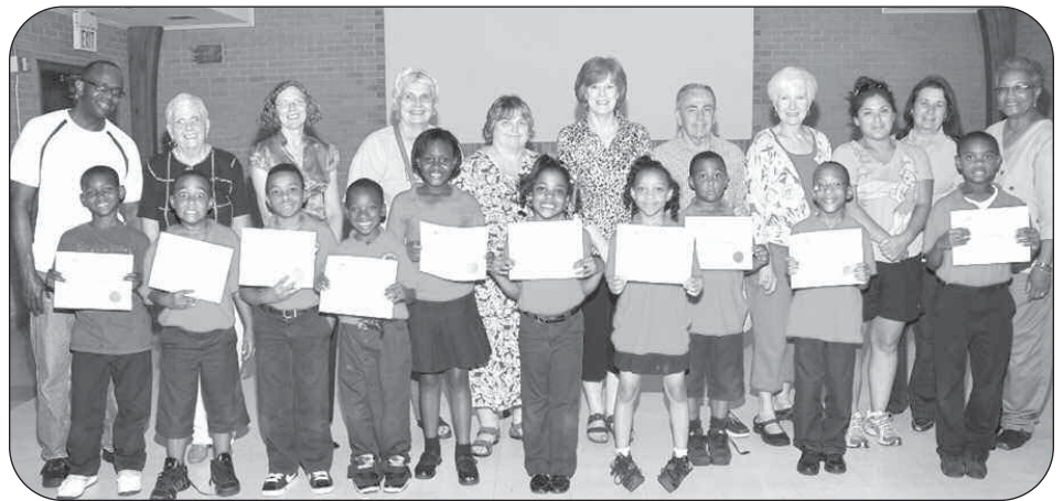
STAIR Graduation at Woodland Presbyterian Church in May 2010.

Marking its 25th anniversary in 2010, STAIR continues to be a successful children’s literacy program in the Greater New Orleans area providing free one-on-one after school tutoring in reading and language skills to at-risk second-grade public elementary school students as well as literacy support to family members. Founded in 1985, STAIR has brought more than 300,000 hours of dedicated volunteer service to its partner public schools to help nearly 6,000 New Orleans area students excel. As it has been for 25 years, STAIR is led by a strong all-volunteer Board of Directors and Advisory Council, staffed by qualified literacy administrators, and endowed with a volunteer force of more than 350 trained community individuals.